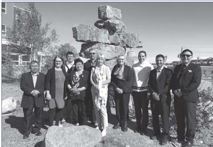
Left: The ICPC (Inuit-Crown Partnership Committee) meeting in Inuvik June 26 provided an opportunity for the Inuit leadership to directly clarify priorities with federal Ministers. Right: Inuvik Drummers and Dancers performing for the ICPC members.

ITK and IRC also presented a series of awards August 16 recognizing the contributions and achievements of Inuvialuit. For a listing and photos, please see next page. ■