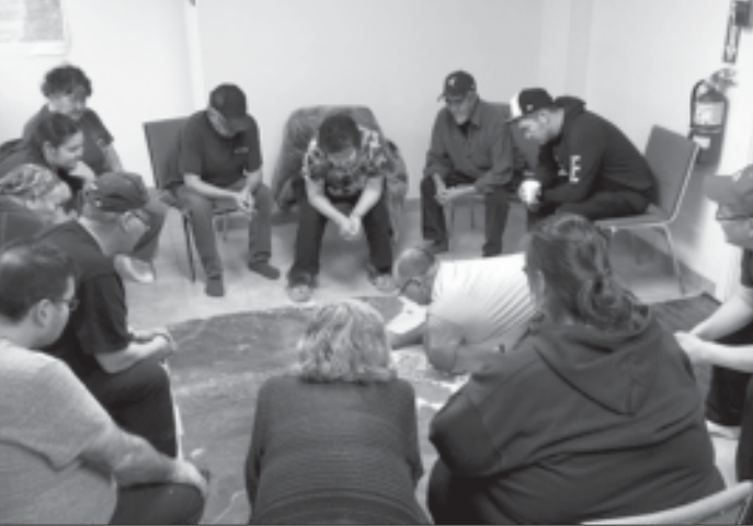
Page 14 De