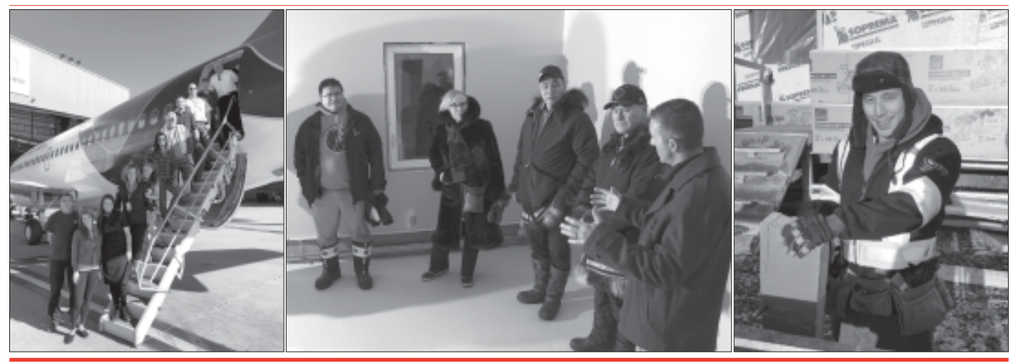
Page 12 December 2017