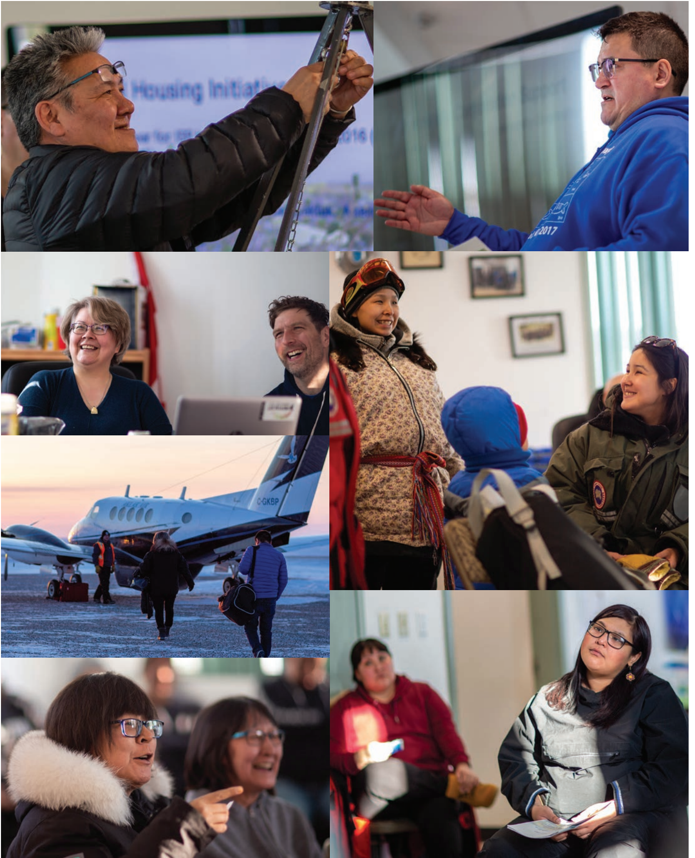
PCC members asked a range of questions, most importantly pressing the issue of IDCC management and timeline for the 4-plex building project still awaiting completion in Paulatuk.

IRC Corporate Tour was held in Paulatuk on April 6