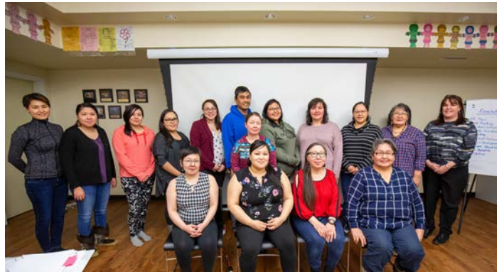
Above: Human Resources course was held in Inuvik January 28-February 5. Community Support at IRC organized the course with MACA (Municipal and Community Affairs, GNWT) and an instructor from Crowe MacKay. 15 students completed and passed the course. All ISR CC Managers and Acting Managers attended and completed the course, Below. Congrats and good to see you all together in a photo.