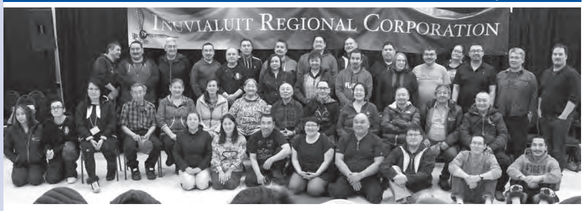
CC Directors from Aklavik, Inuvik, Paulatuk, Sachs Harbour, Tuktoyaktuk, Ulukhaktok.

...with the 42 Directors. Ublumi. Uvlumi. Good day.