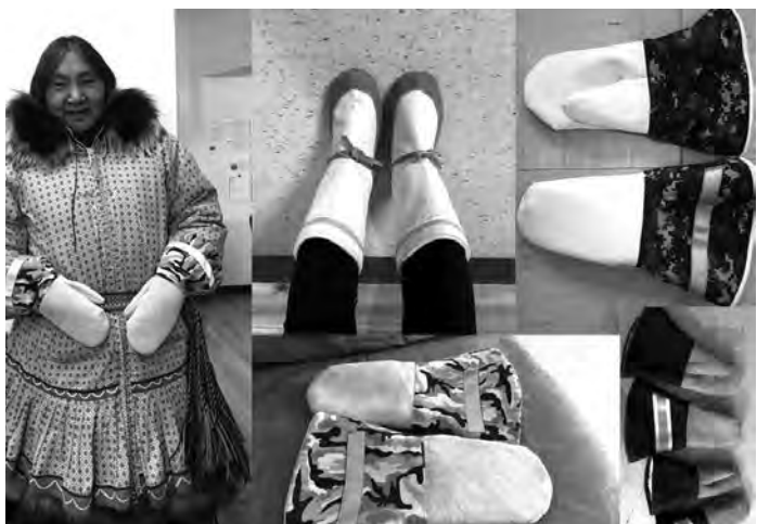
March 2019 Page 7