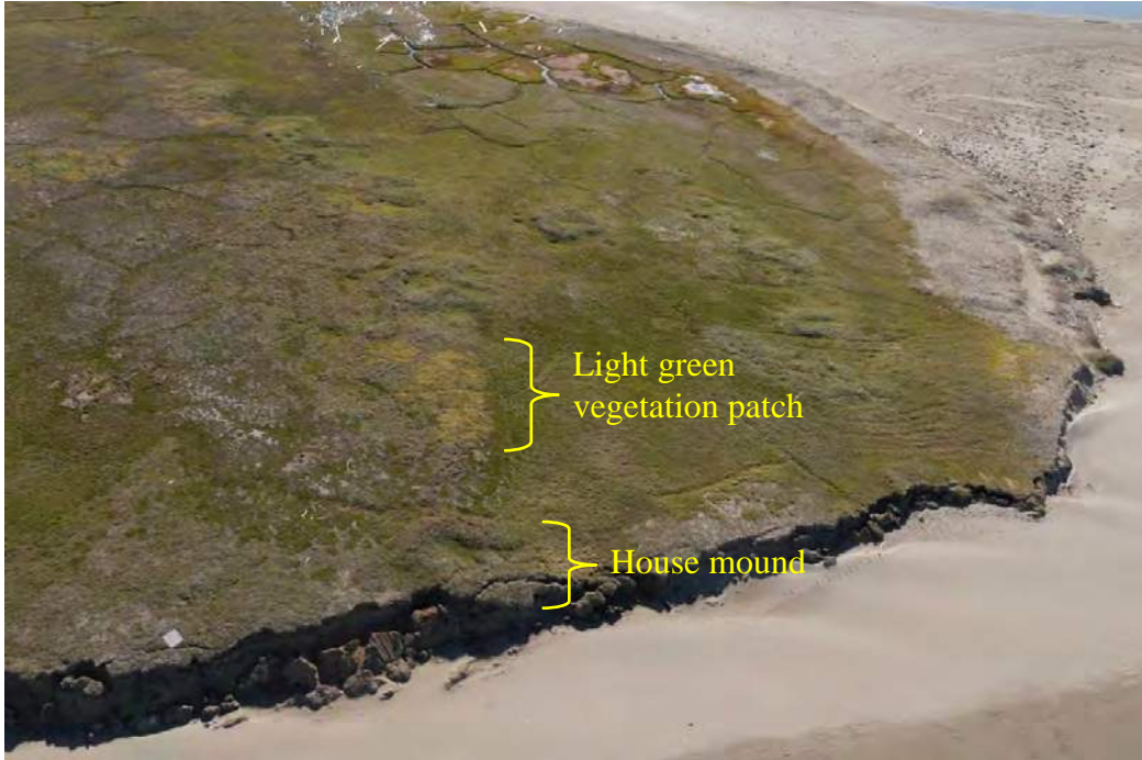
McKinley Bay in 2013. Note the light green vegetation patch in centre of photo, and the complete house mound below it.

The McKinley Bay site near the northeast end of the Tuktoyaktuk Peninsula is eroding rapidly. Below, a comparison of 2013 and 2017 air photos shows that an entire house has eroded in the last four years.