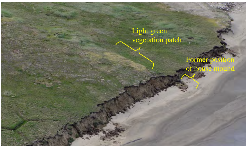
McKinley Bay in 2017. The light green vegetation patch is now at the edge of the eroding bluff, and the house mound is completely gone. In just four years, an entire house has been destroyed, and the bluff continues to erode back towards other houses.