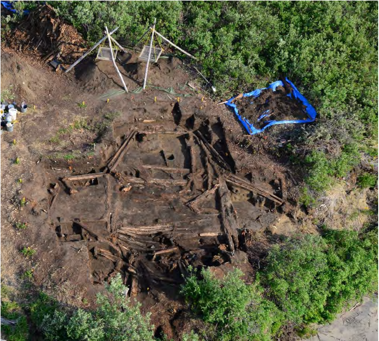
An air photo of the house nearing the end of excavation. The overall shape of the house can be clearly seen of a central square floor area with three alcoves – two on each side, and one at the back. The alcove on the right is eroding down the slope. The large dark pit at the bottom of the photo is the entrance area. It was badly slumped and eroded.