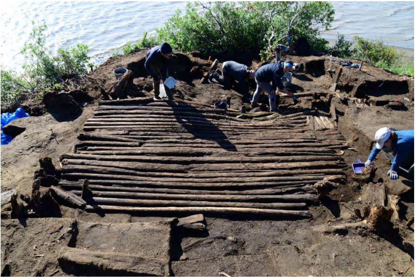
Near the end of the excavation, we came down to a spectacularly well-preserved floor in the main room. The remains of four posts that held up the roof can be seen at each corner.