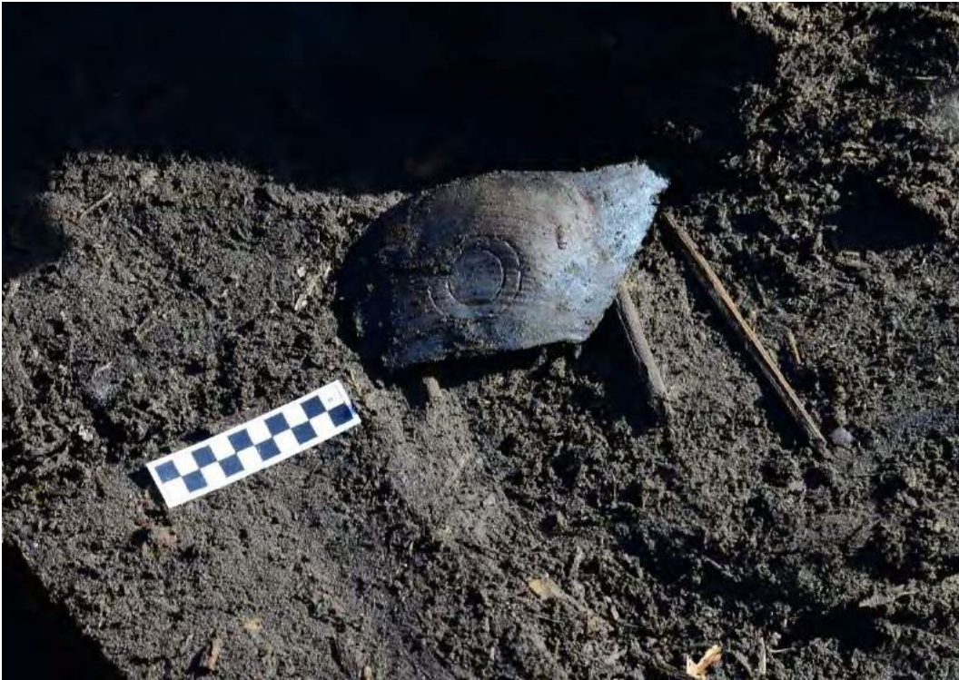
Part of a wooden artifact – possibly a bowl – with a very precisely-made double circle design.