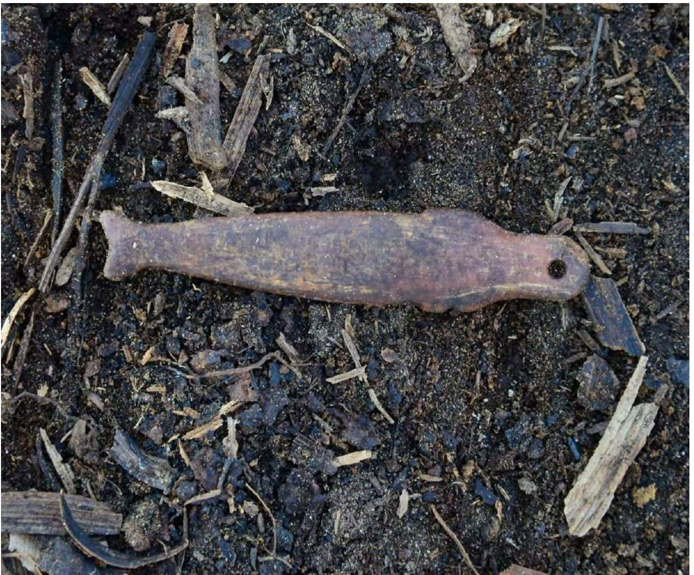
A small ivory pendant in the shape of a beluga whale, found under a house floor.