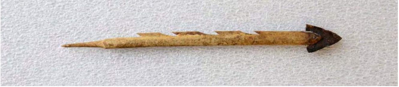
An antler arrowhead with an iron blade, indicating that Inuvialuit had begun to trade for useful European materials in the mid-1800s.