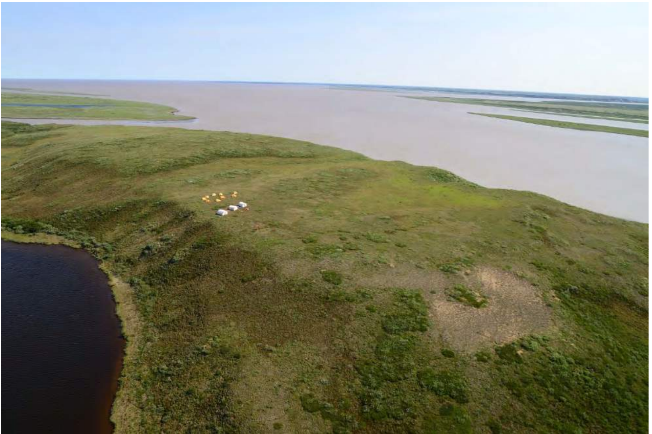
The 2017 camp at Kuukpak. The yellow sleeping tents are surrounded by an electric bear alarm fence. The three white tents are the cook tent, storage tent, and artifact tent where all artifacts are carefully cleaned and packed. The main site of Kuukpak is on the slopes down to the water's edge at upper right.