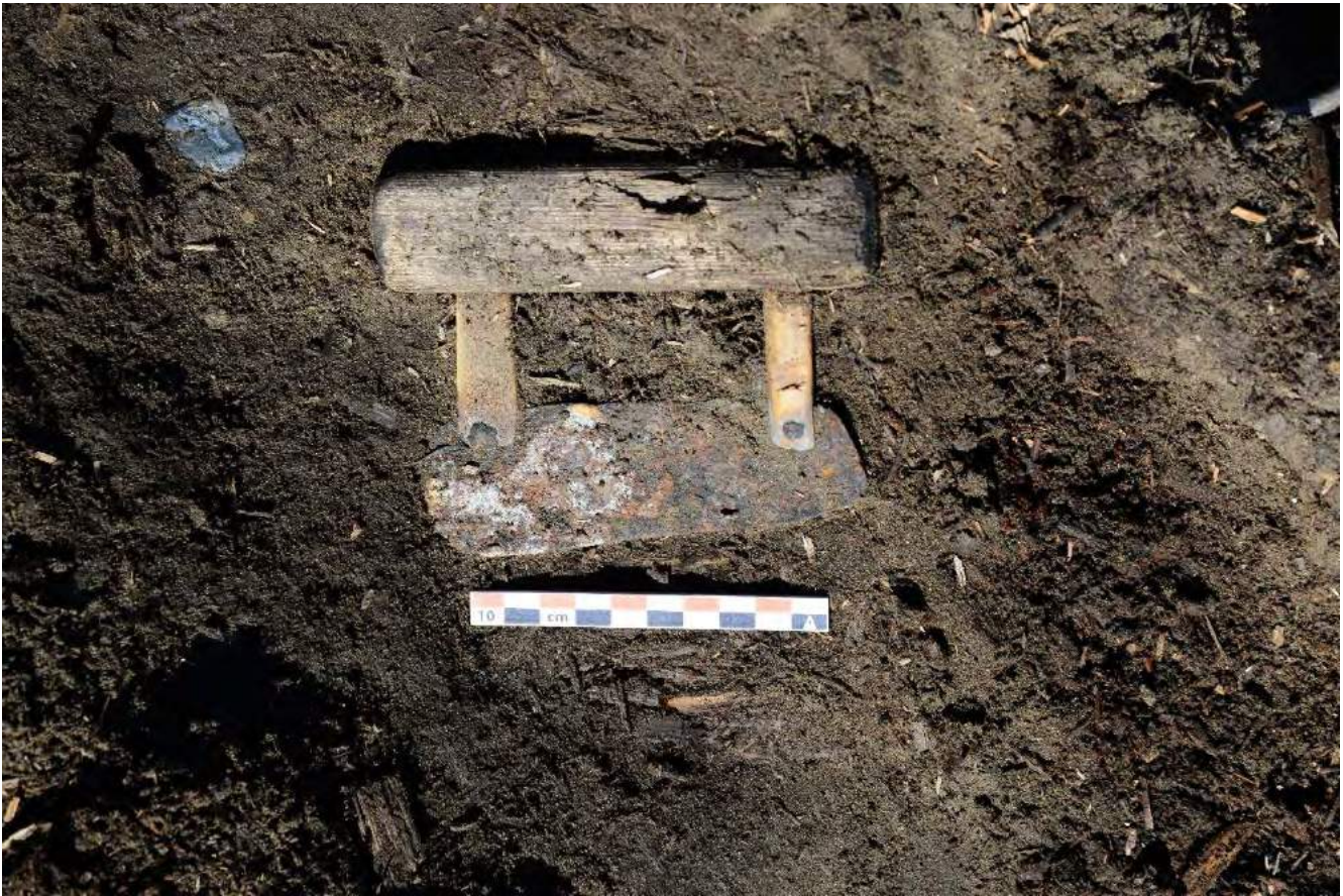
Our favourite artifact – an ulu with a wooden handle, two antler tangs, and an iron blade.