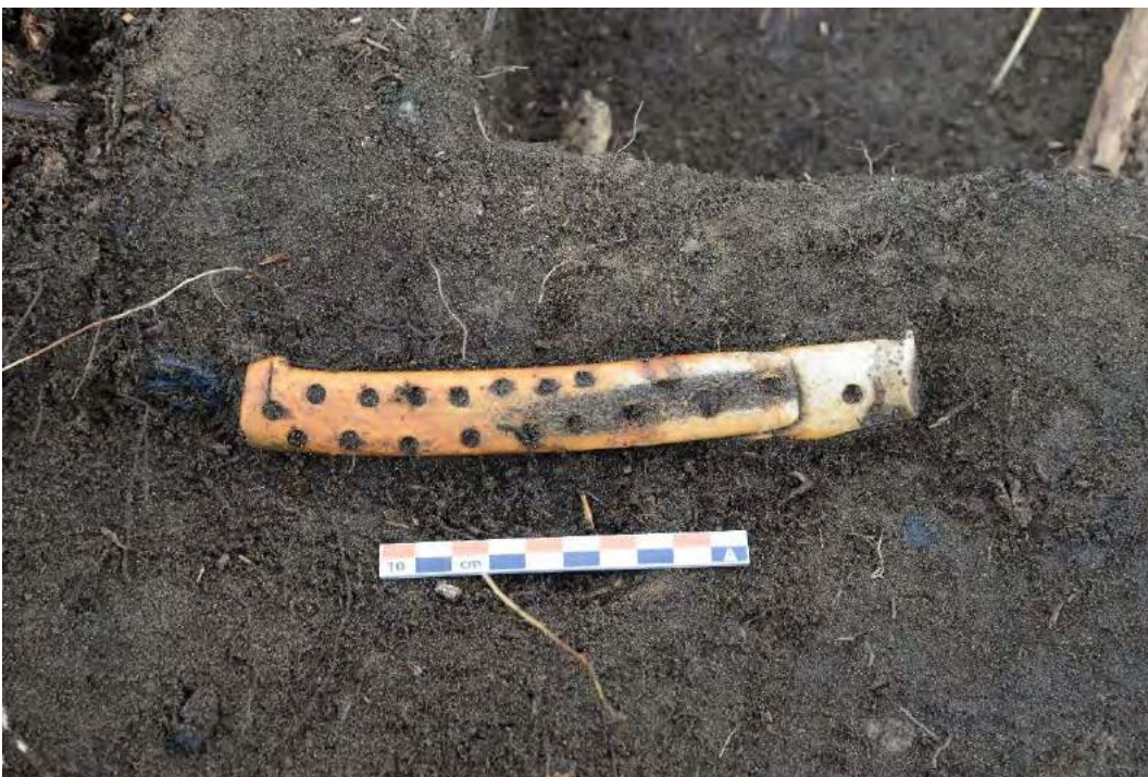
A two-part knife handle made of caribou antler.